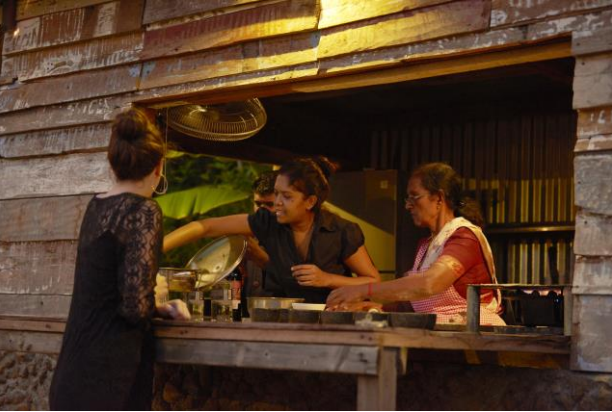
“La Kaze Mama” Herb Garden Restaurant