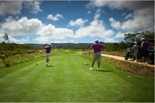
“Unlimited green fee at Avalon Golf Estate”