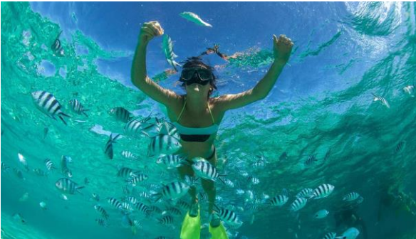
Snorkeling at Coral Garden