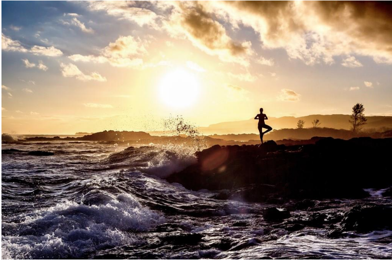
“Your 365-days yoga retreat venue”