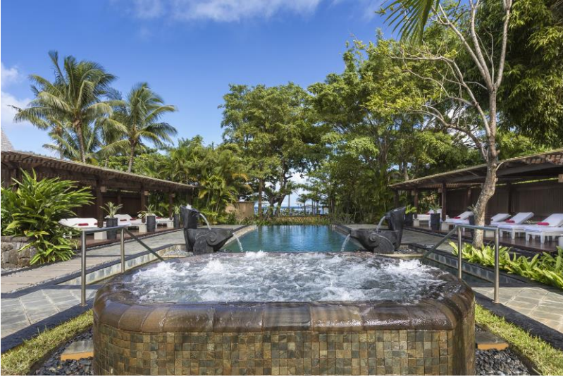
Pool with Jacuzzi