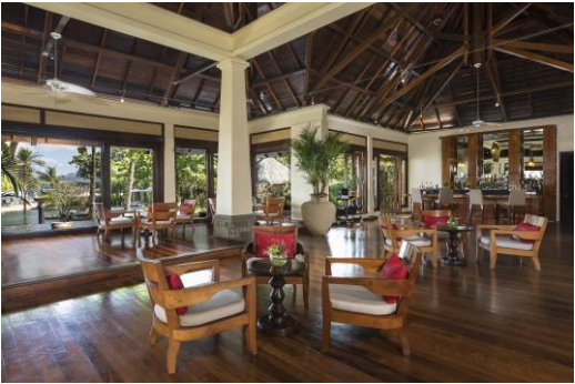
“Red Ginger” Bar & Pool Lounge