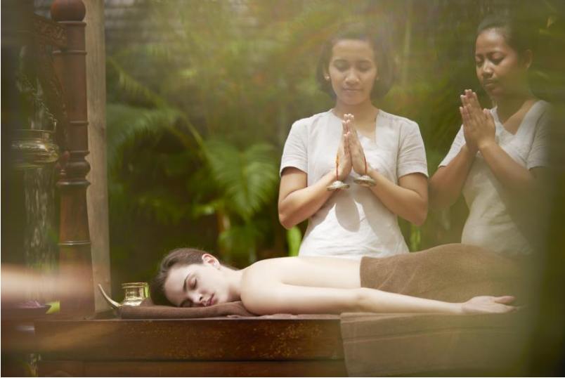
International & Visiting Therapists