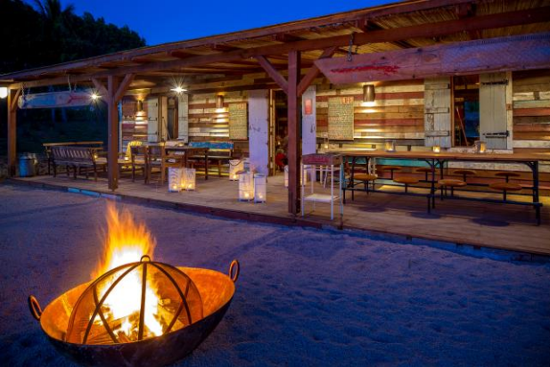
“Rum Shed” Bar & Grill Restaurant