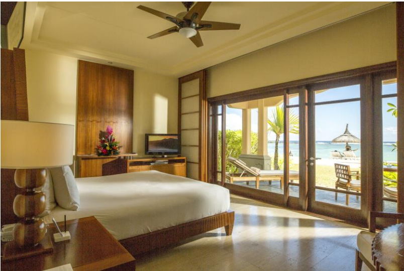
“Unrivalled views and beach lifestyle”