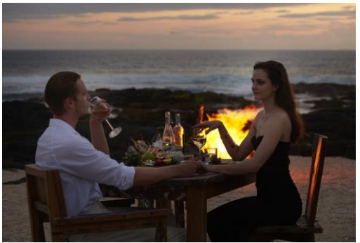
Private Dining | Shanti Moments