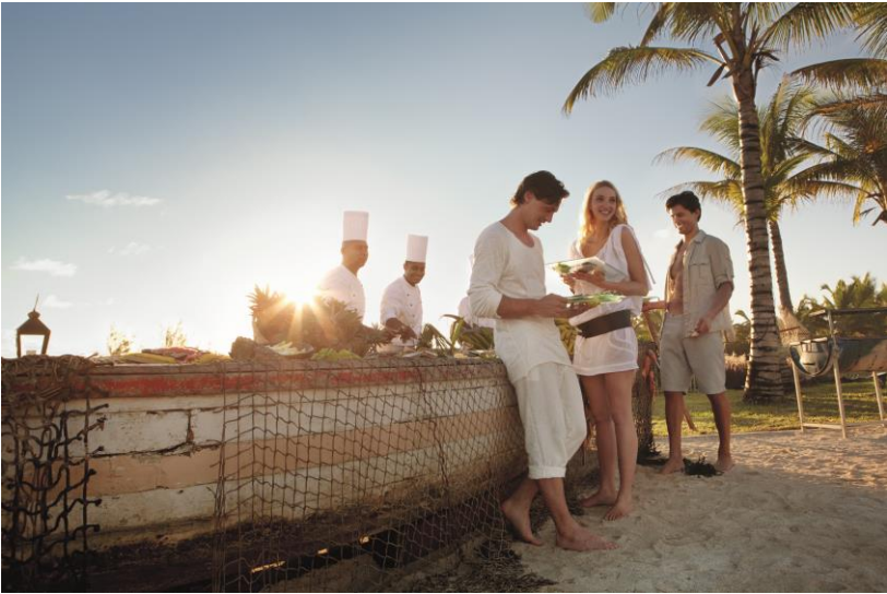
“Authentic culinary experience with dine-around option”