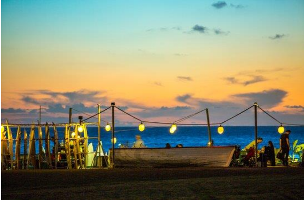
“Fish Shack” Experience