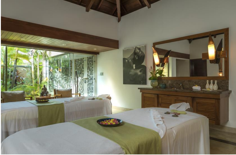
Couple Treatment Room