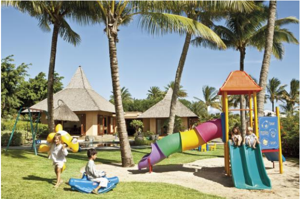
“Family life at its best”