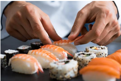
“Sushi Lounge” Asian Specialties