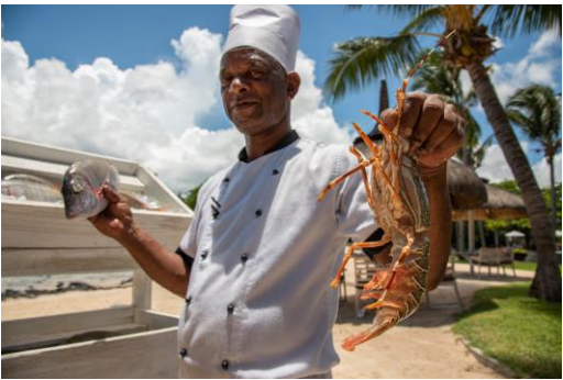
“Fish Market” at Stars On The Beach