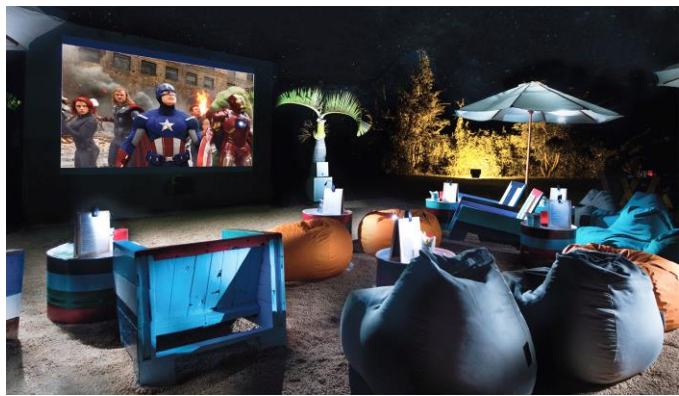
“Open-air cinema experience”