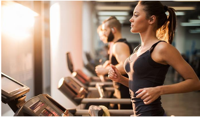
Gym & Fitness