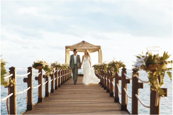
The ideal place to say “I do”